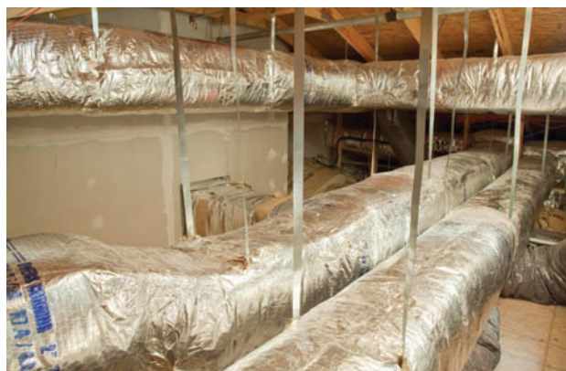
Figure 5: Cottage 6B, Glass Fiber Insulated Sheet Metal Ductwork Installation

Finally, because the buildings and the ductwork installations are a long-term investment for Luther Home of Mercy, financing and project life were set at 30 years.